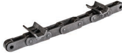
Cotton Module Channel Bar Chain