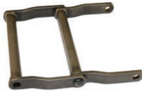
Welded Drag Chain