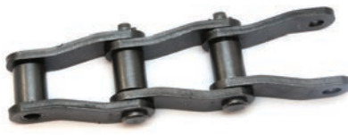
Offset Steel Drive Chain