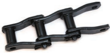
Welded Steel Mill Chain