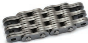
Port Lift Chain