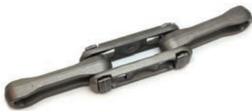
Drop Forged Chain