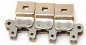
Bookbinding (Bindery) Chain