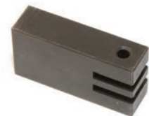
Clevis / Chain Anchor