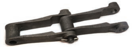
700 Series Cast Pintle Chain