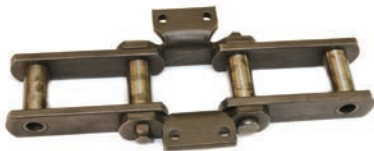
Steel Bushed Chain