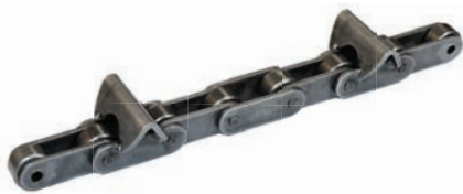
Cotton Module Chain