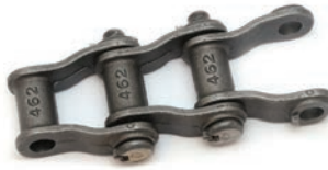
400 Series Cast Pintle Chain