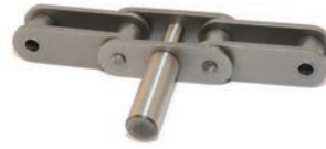
Double Pitch D-5 Chain