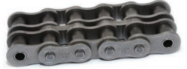
Multi-Strand Roller Chain